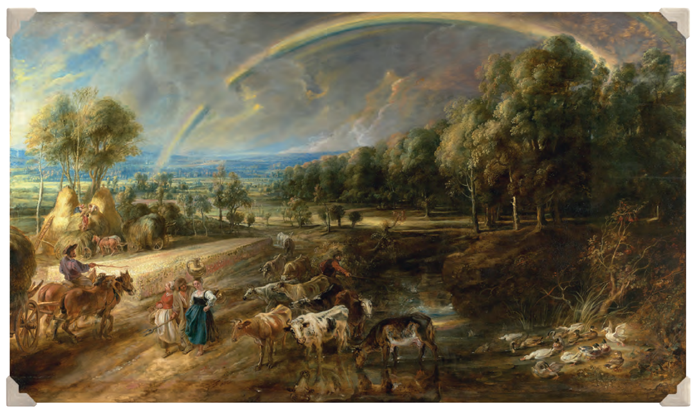
Pieter-Paul Rubens, The Rainbow Landscape, c.1636