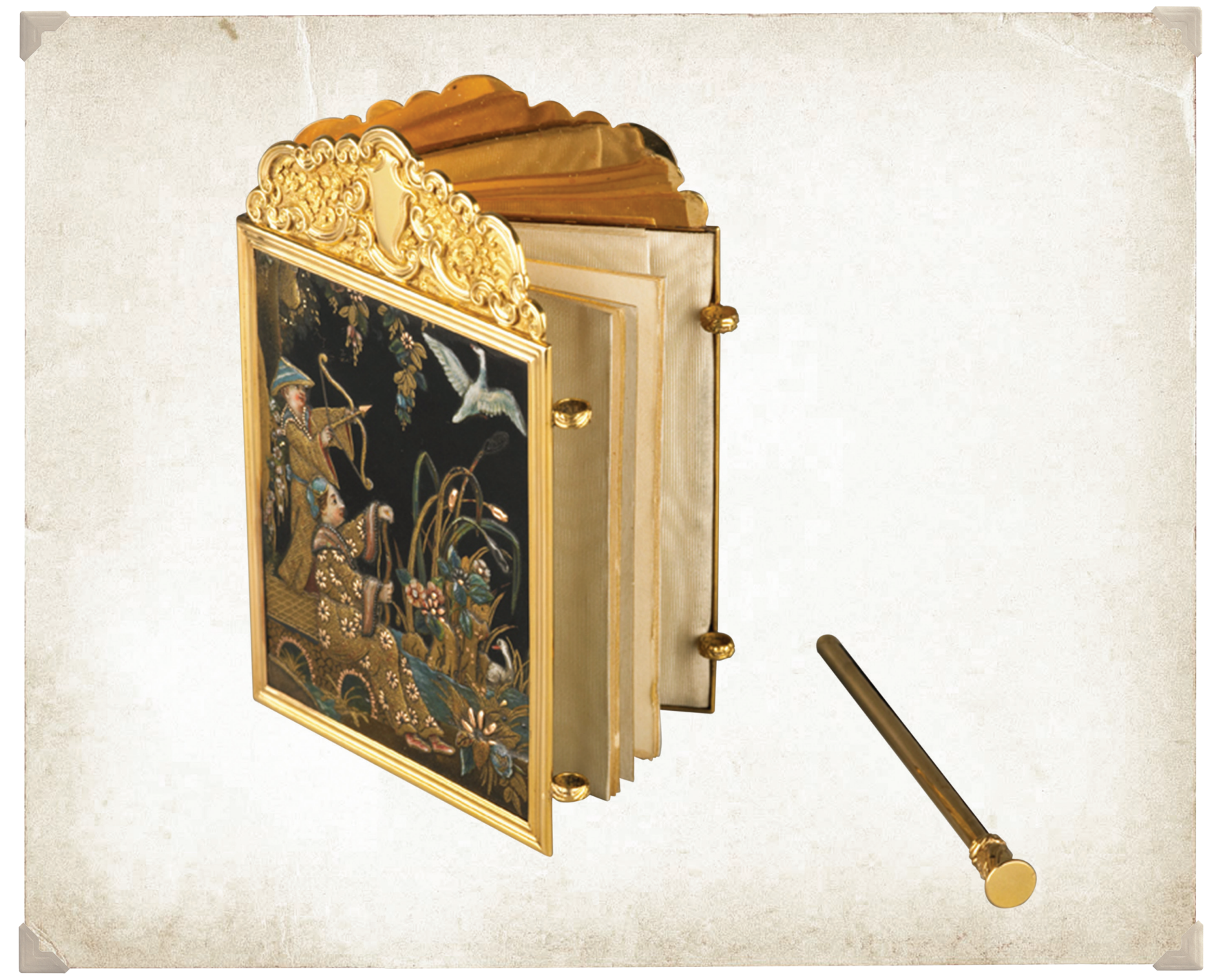
Almanac (carnet), Unknown Artist / Maker, France, c 1830