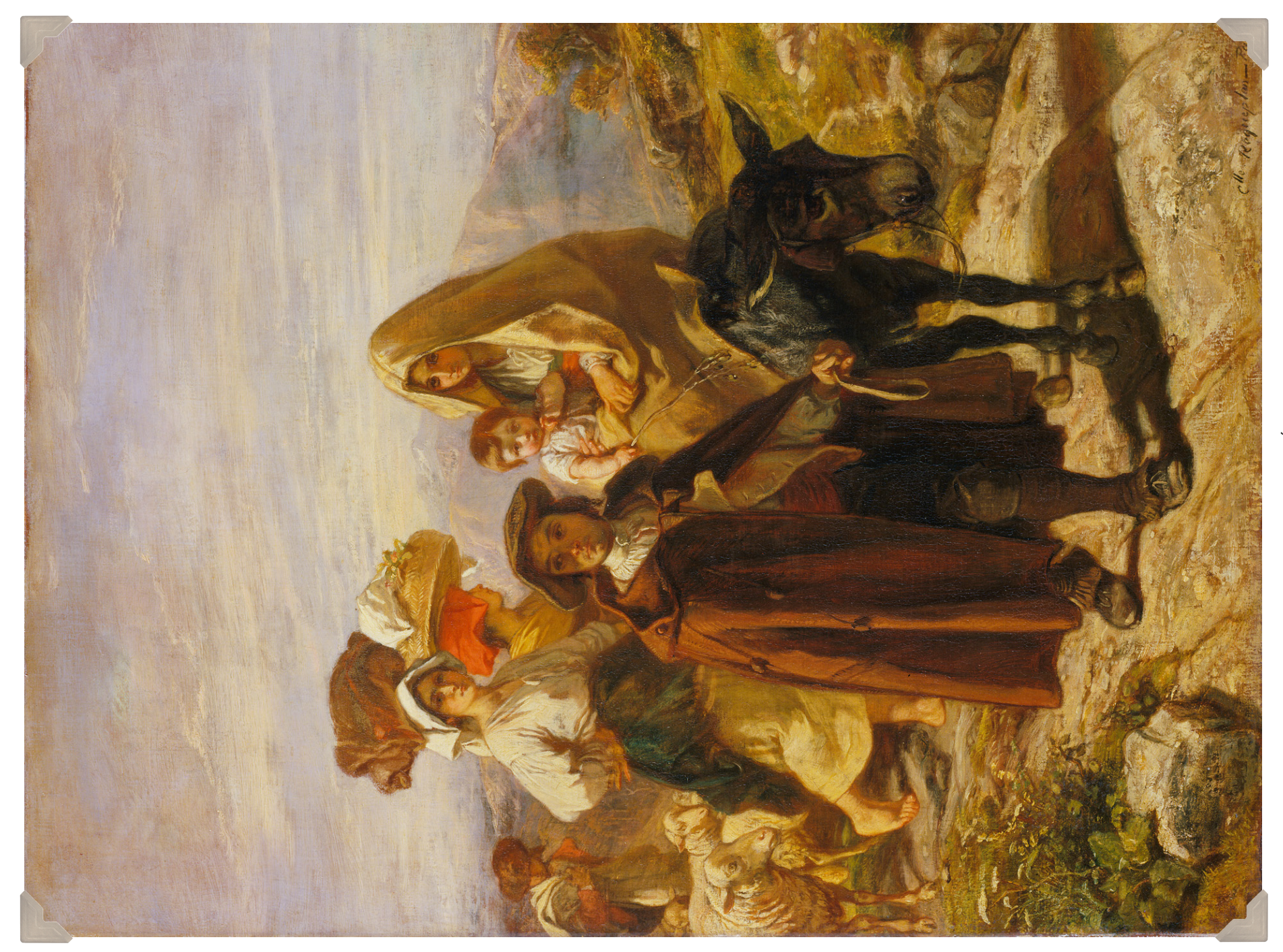
Camille (Joseph-Étienne) Roqueplan, Peasants of Béarn, 1846