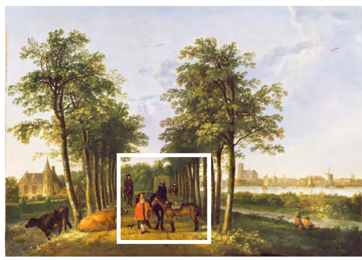
Page 5 of 8