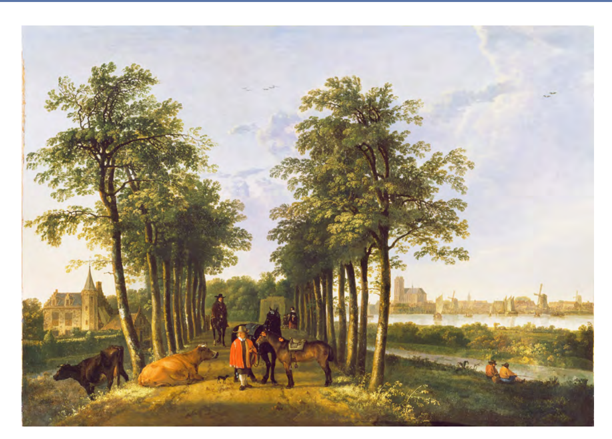
Aelbert Cuyp The Avenue at Meerdervoort Early 1650s