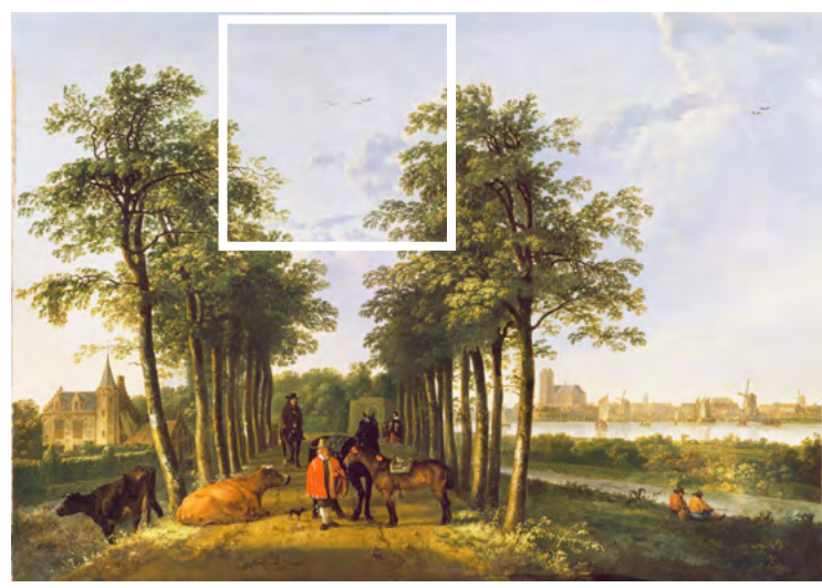
Page 8 of 8