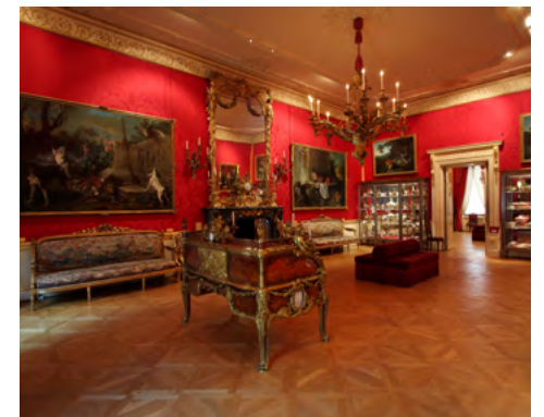
The Back State Room with chandelier, Hertford House