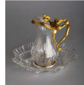
Ewer and basin