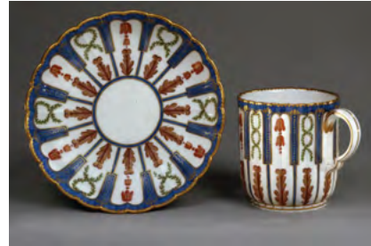
Cup and saucer