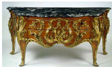
Louis XV's Commode