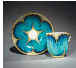
Cup and saucer