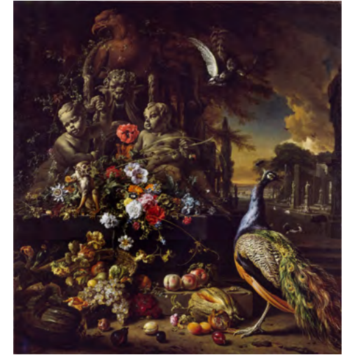
Jan Weenix, Flowers on a Fountain with a Peacock , c. 1700-1710