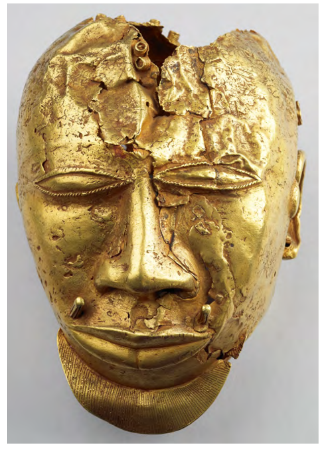
Trophy head, 18th or 19th century