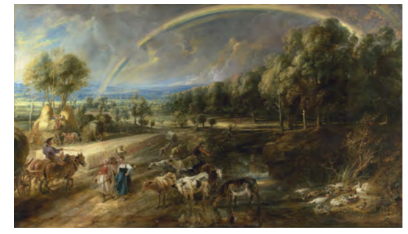
Peter Paul Rubens, The Rainbow Landscape c. 1636