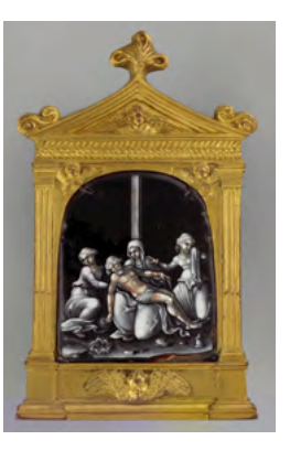
Pax, mid-16th century