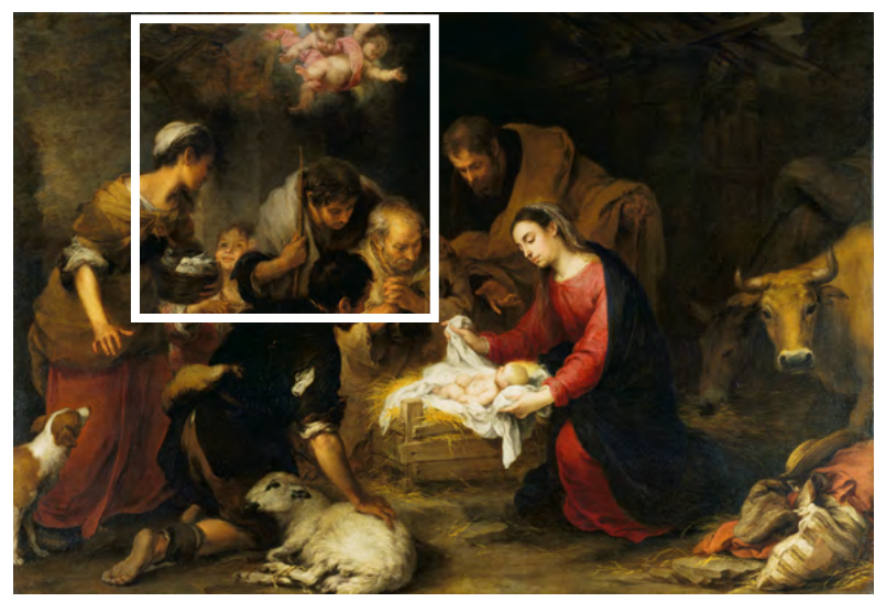
Page 7 of 20