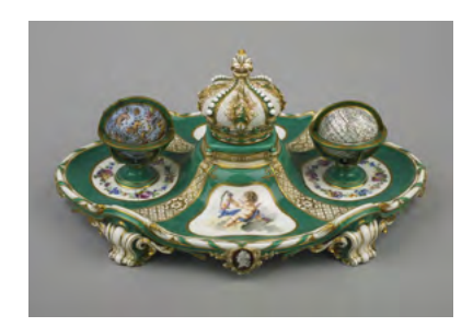
Manufacture de Sèvres Ecritoire 'à Globes' Inkstand, 1759