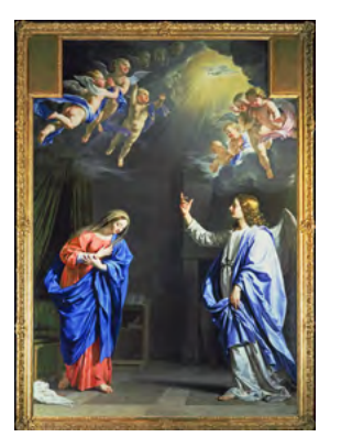
Philippe de Champaigne The Annunciation c. 1648