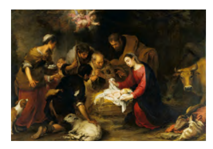
Bartolomé-Esteban Murillo The Adoration of the Shepherds c. 1665–c. 1670