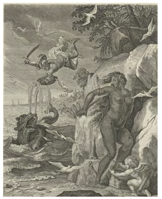
Detail from Bernard Picart (workshop of), after Bernard Picart, Perseus en Andromeda, 1731.

This text appeared in The Guardian newspaper, and is a revised and expanded version of a social media post that appeared on the Wallace Collection's platforms on 30 October 2020 as part of #WallaceConnections, a new initiative aiming to explore the often hidden narratives that connect the museum's holdings to broader social and cultural issues.